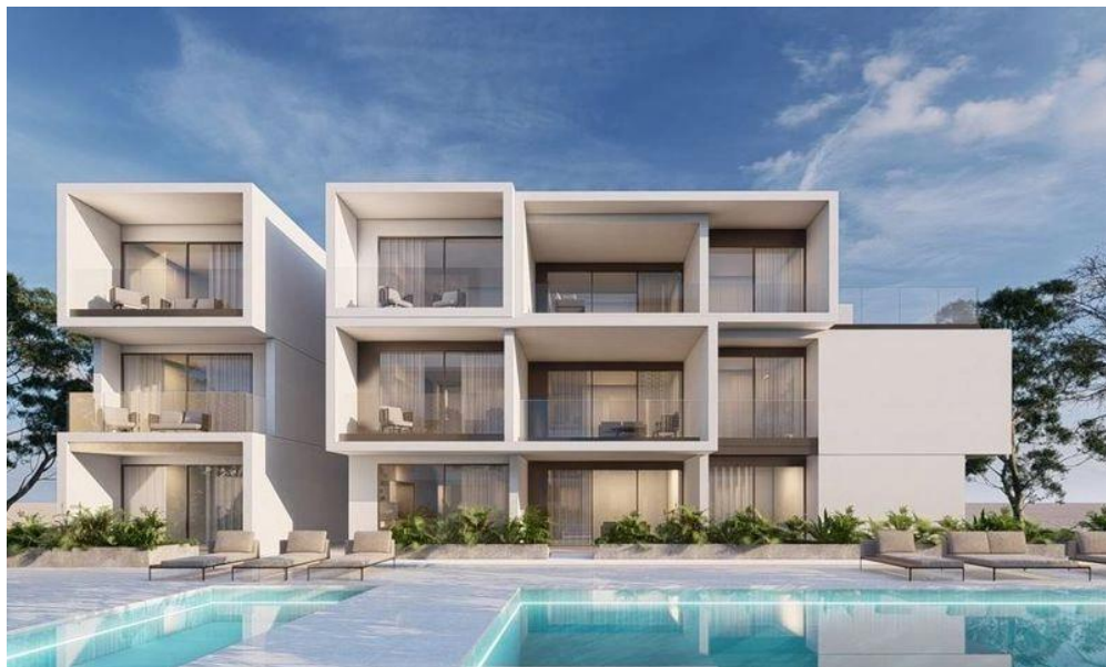
Block A // First floor