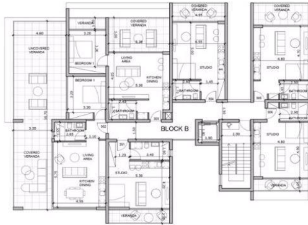
Block B // First floor