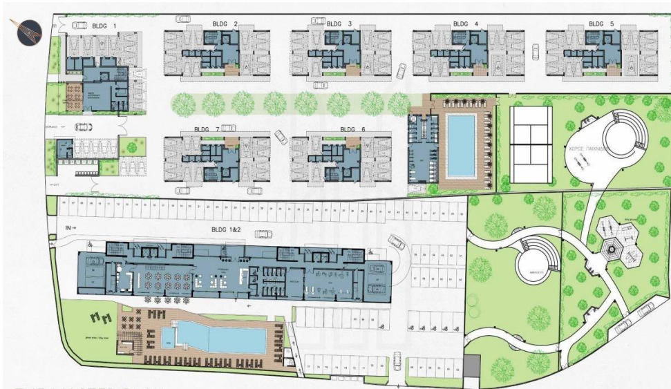
THE MASTER PLAN