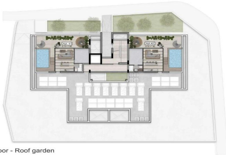
5th Floor - Roof garden