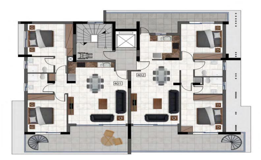
ΚΑΤΟΨΗ 4ου ΟΡΟΦΟΥ