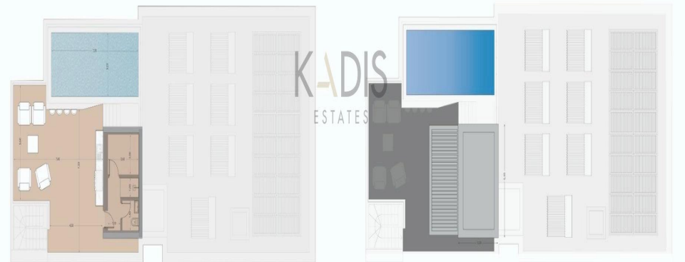
Roof Top Plan.