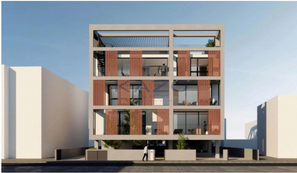
MESA GEITONIA, LIMASSOL