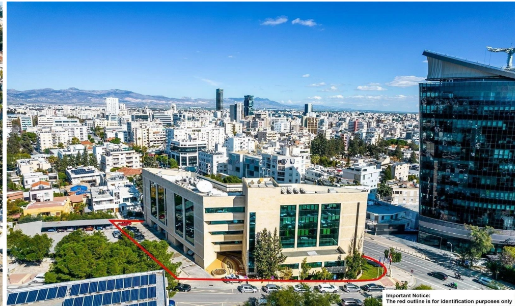
Important Notice: The red outline is for identification purposes only