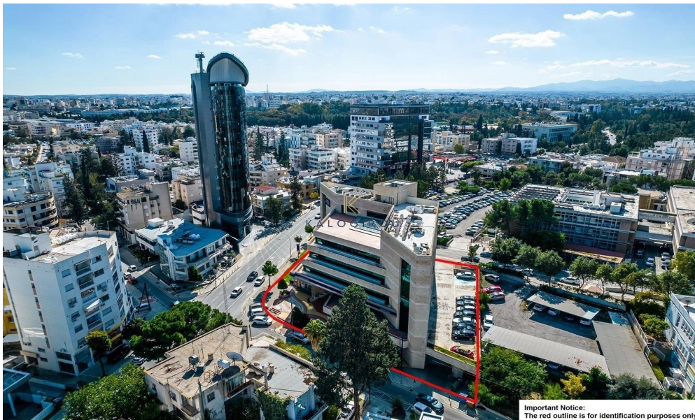
Important Notice: The red outline is for identification purposes only