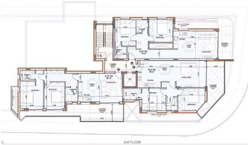
2. 2nd FLOOR 1:100