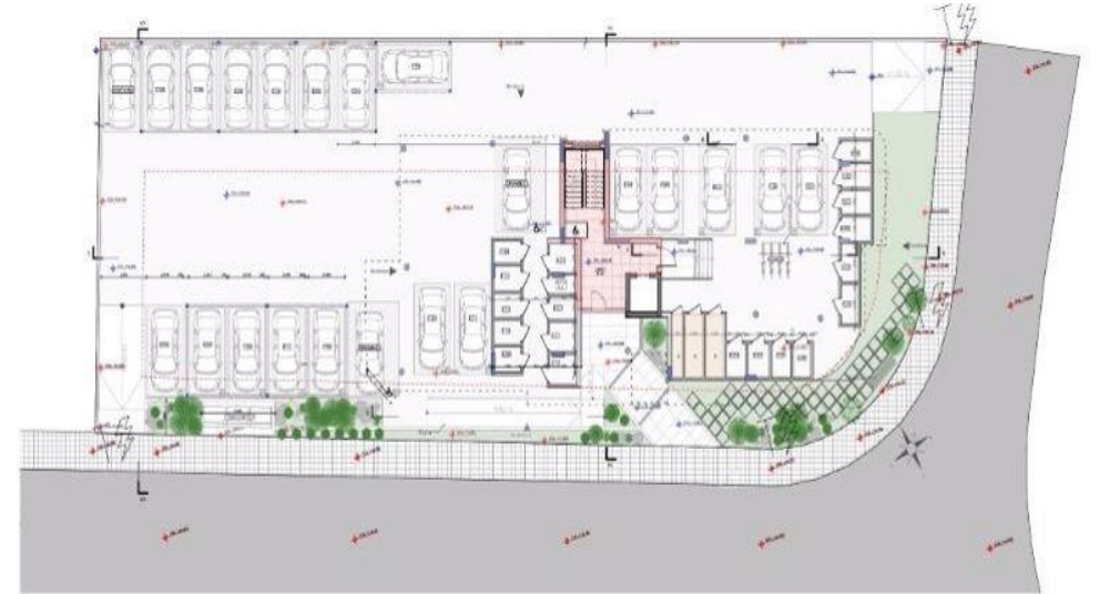
0. GROUND FLOOR 1:200