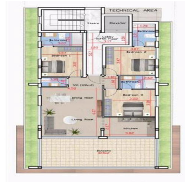
501 3 Bedroom 4 Bathroom 108 SQM Internal Area 21.3 SQM Covered Veranda