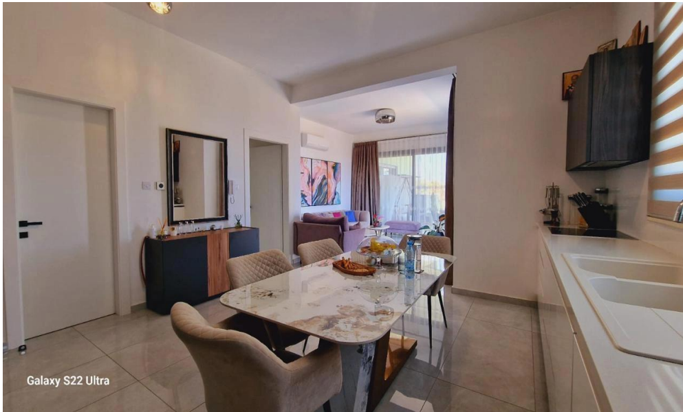
Galaxy S22 Ultra