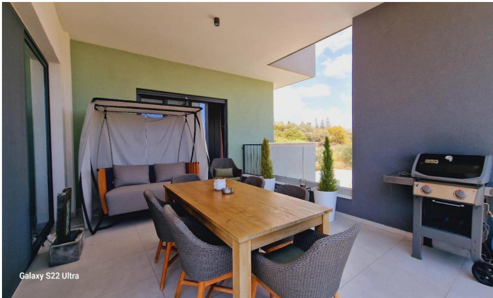
Galaxy S22 Ultra