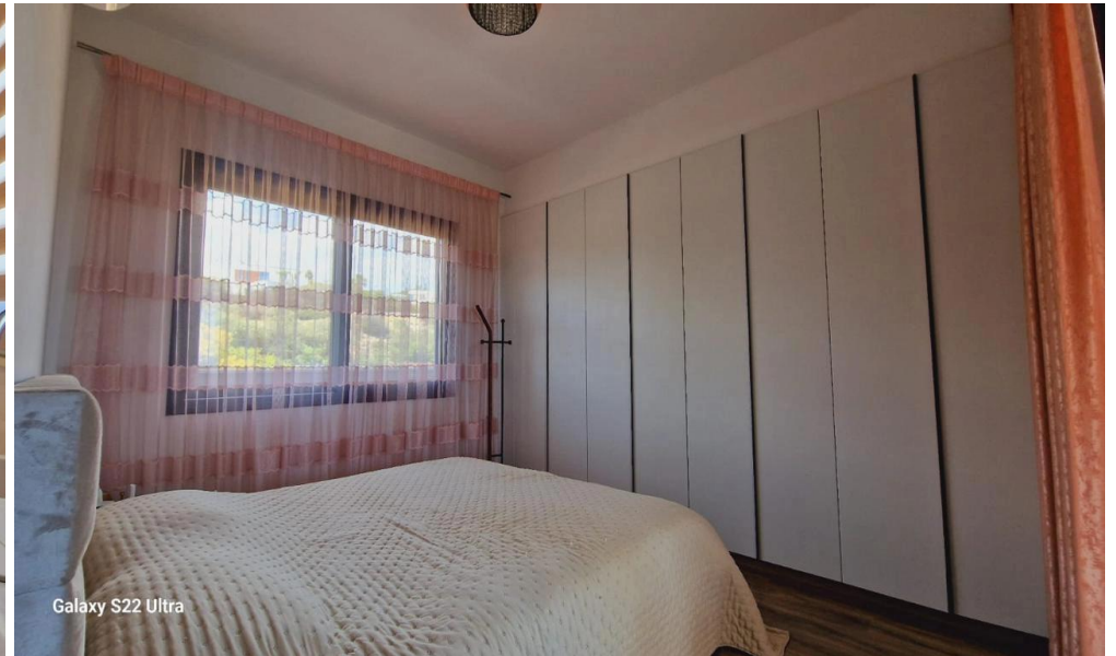
Galaxy S22 Ultra