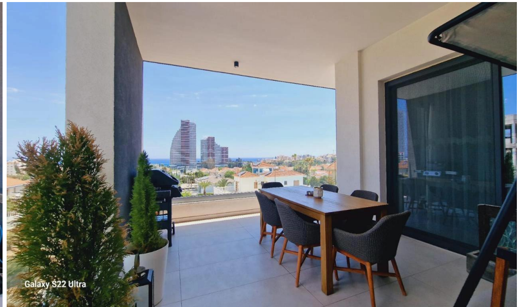
Galaxy S22 Ultra