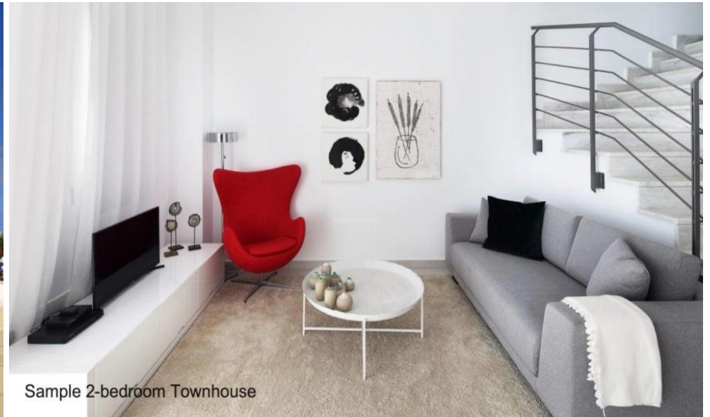
Sample 2-bedroom Townhouse