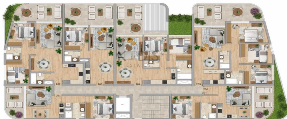
2 ND floor