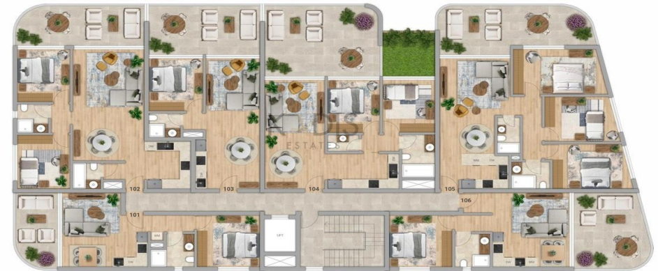
1 ST floor