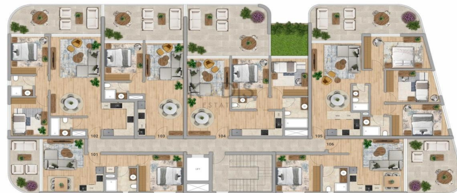
1 ST floor