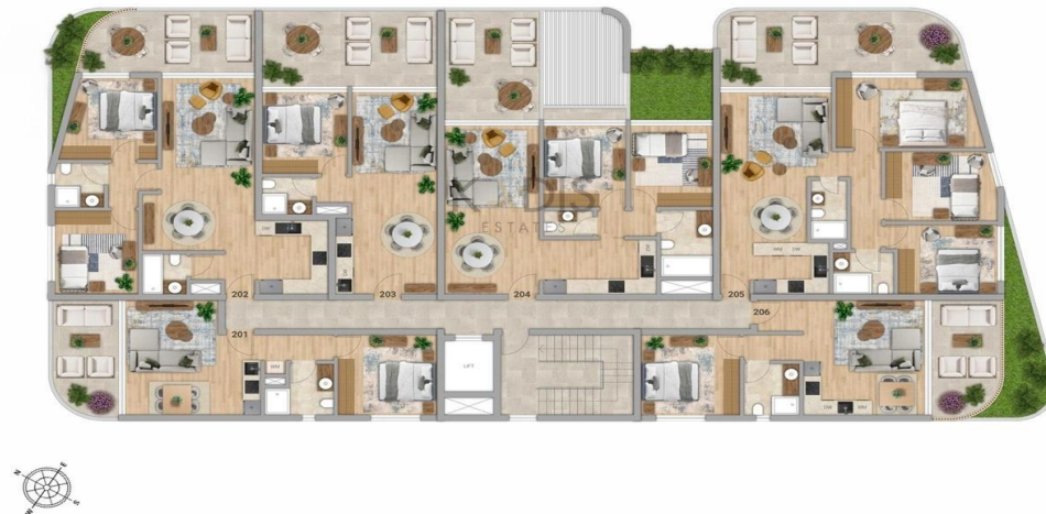
2 ND floor