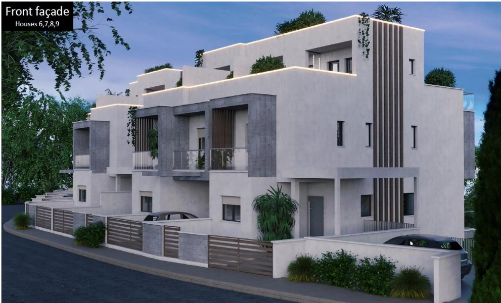
Front façade Houses 6,7,8,9