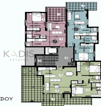
ΚΑΤΟΨΗ ΔΕΥΤΕΡΟΥ ΟΡΟΦΟΥ