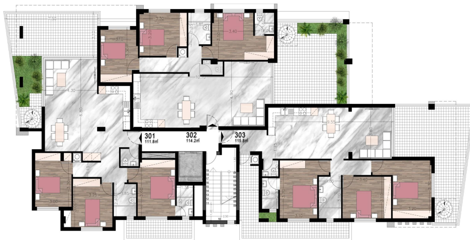
3rd FLOOR PLAN