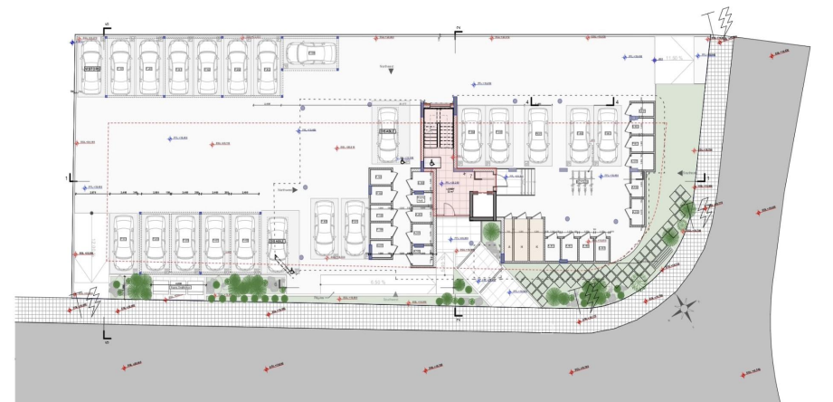
0. GROUND FLOOR 1:200