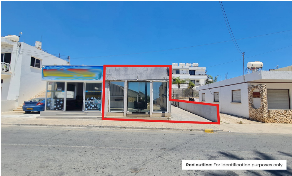
Red outline: For identification purposes only