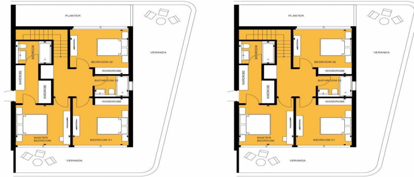
LIMASSOL LUXURY APARTMENTS