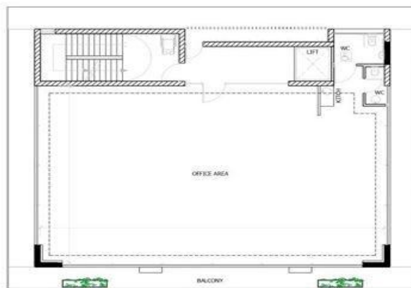
1st, 2nd, 3rd, 4th FLOOR PLAN