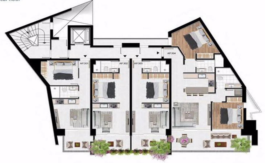
■ Typical floor F3