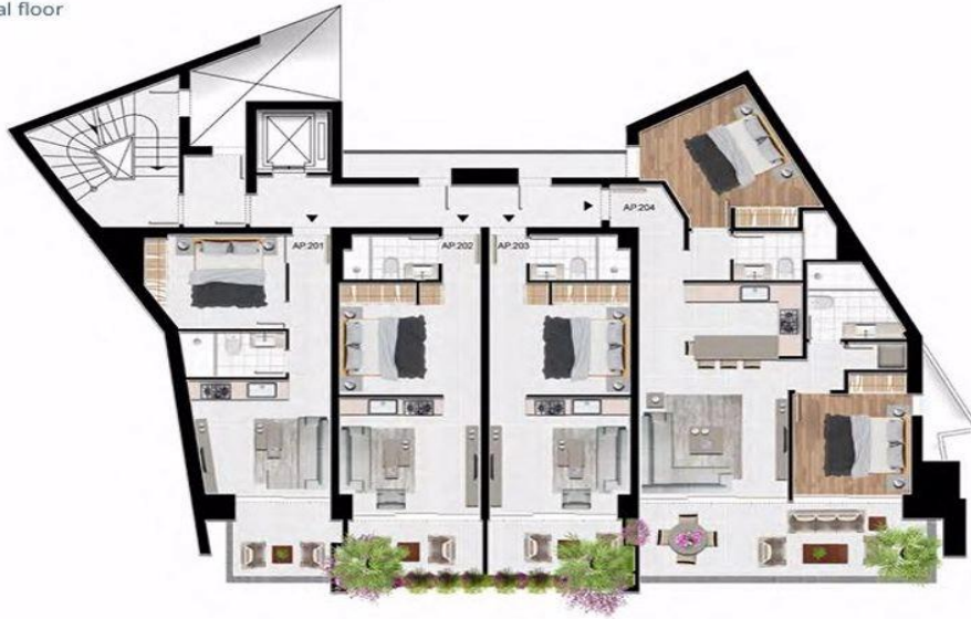
■ Typical floor F2