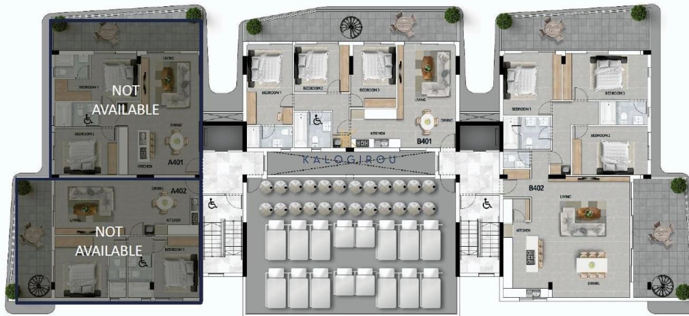
FLOOR PLANS – FOURTH FLOOR