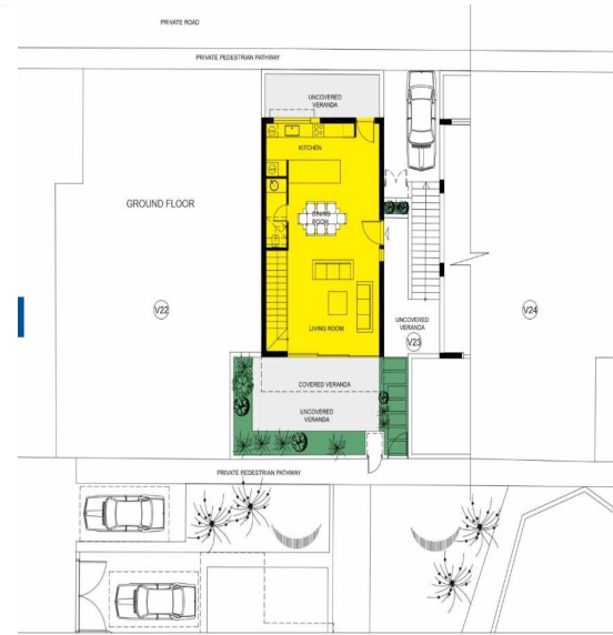
lev. Date (Architectural Department): 01 / 07 / 24 - Rev. No (Architectural Department): 1.3