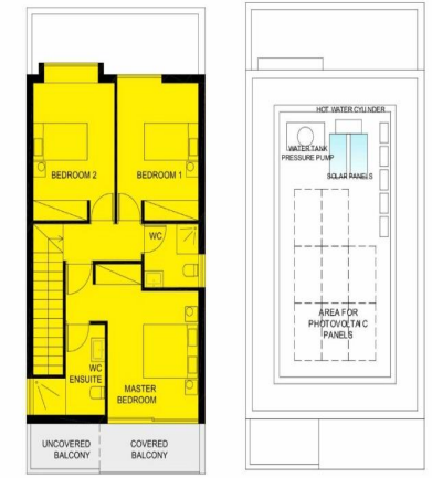
Rev. Date (Architectural Department): 12 / 01 / 24 - Rev. No (Architectural Department): 1.2