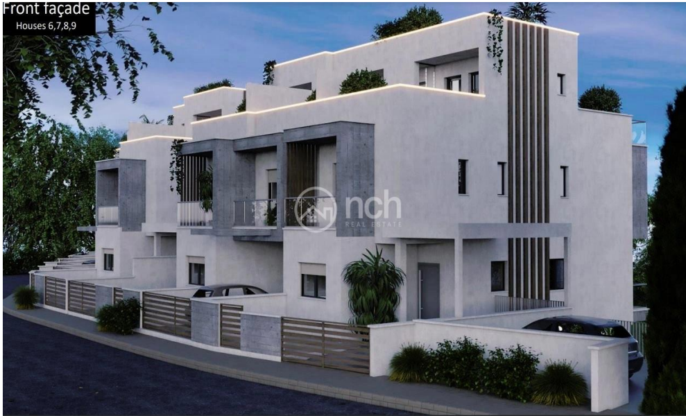
Front façade Houses 6,7,8,9