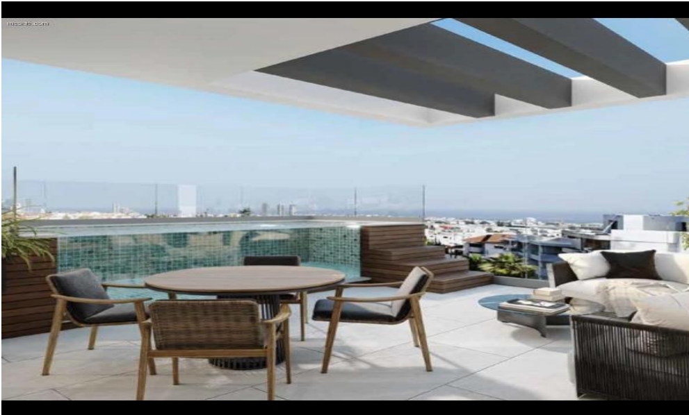
3RD FLOOR >>