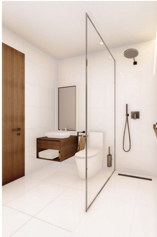
4. VIEW 17