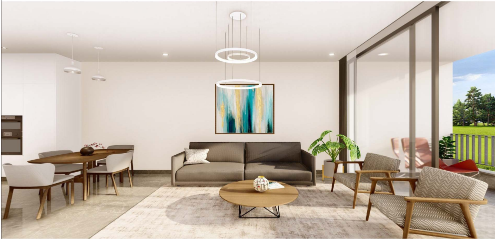
TROUZERI / ARCHITECTURE & INTERIOR CONCEPT