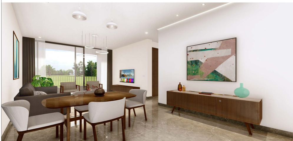
4. VIEW 02

TROUZERI / ARCHITECTURE & INTERIOR CONCEPT