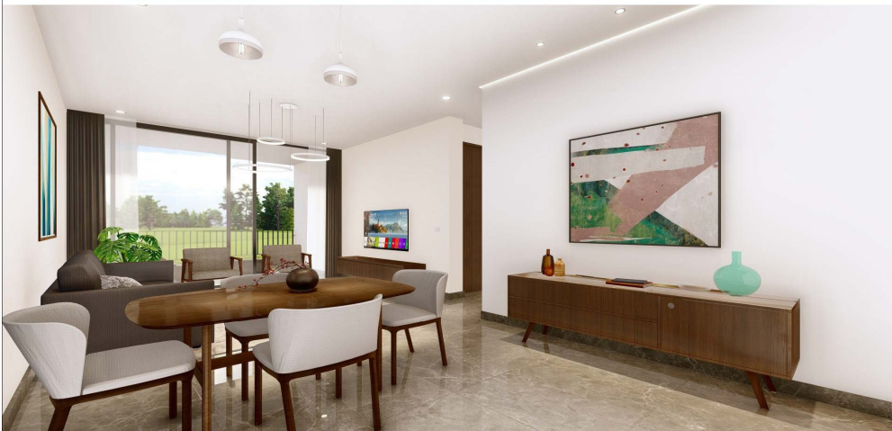
TROUZERI / ARCHITECTURE & INTERIOR CONCEPT