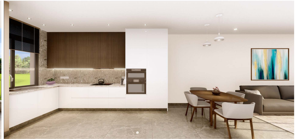
TROUZERI / ARCHITECTURE & INTERIOR CONCEPT