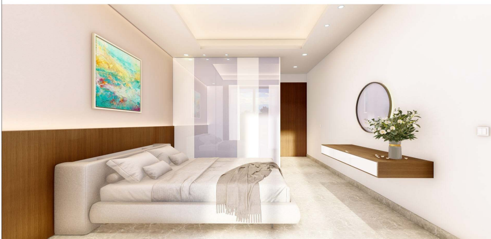
4. VIEW 11

TROUZERI / ARCHITECTURE & INTERIOR CONCEPT