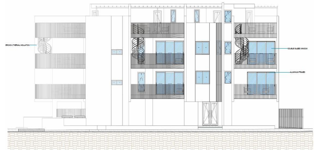
FRONT VIEW 1 : 100