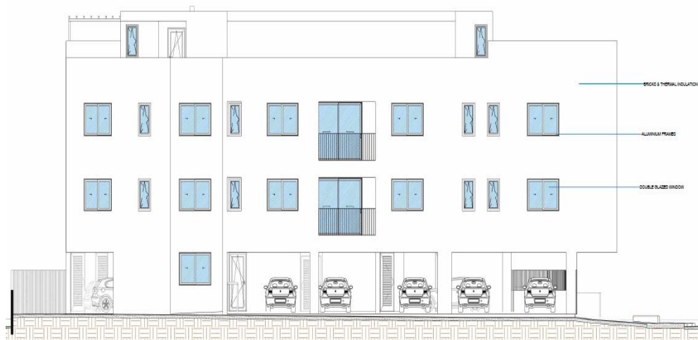
BACK VIEW 1 : 100