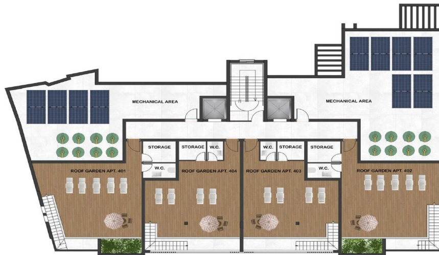
Rooftop terrace layout