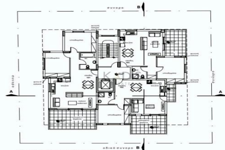
ΚΑΤΟΨΗ 2ΟΥ ΟΡΟΦΟΥ ΚΛΙΜΑΚΑ 1:200