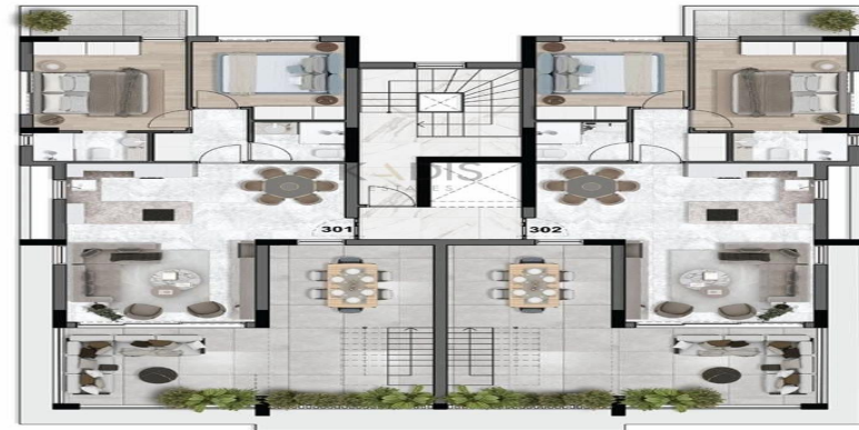
ROOF GARDEN >>