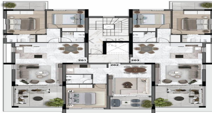
<< 2ND FLOOR