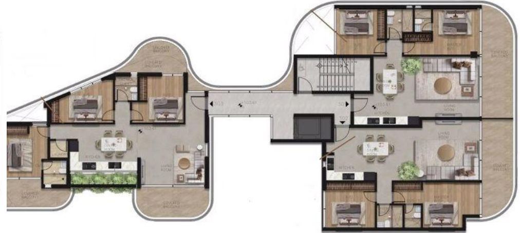
- Third Floor - Plans - Area