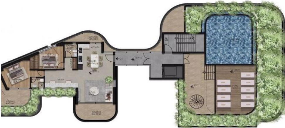
Fourth Floor - Plans - Area