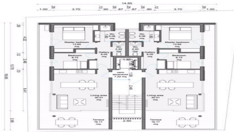
1st FLOOR Scale 1:100