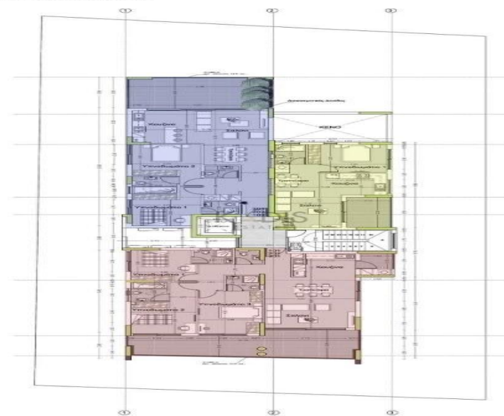
ΚΑΤΟΨΗ 2ου ΟΡΟΦΟΥ