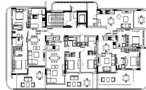
BUILDING D FIRST FLOOR