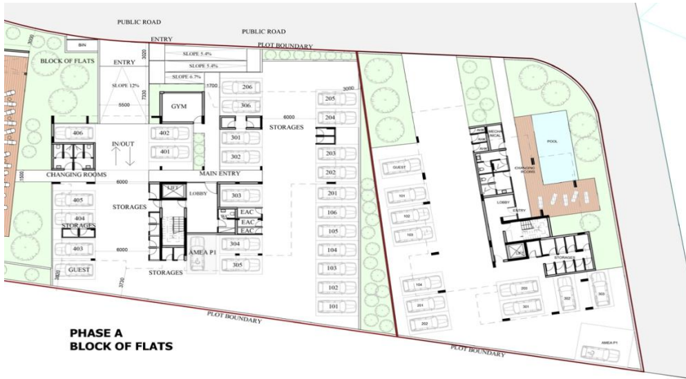
PHASE A BLOCK OF FLATS