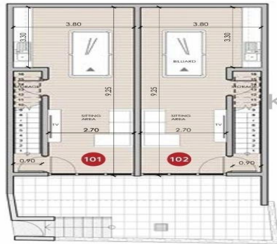
MEZZANINE ABOVE GROUND FLOOR