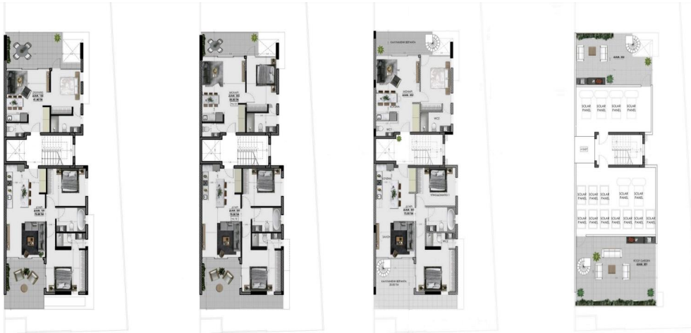
ΚΑΤΩΦΗ 1ΟΥ ΟΡΟΦΟΥ