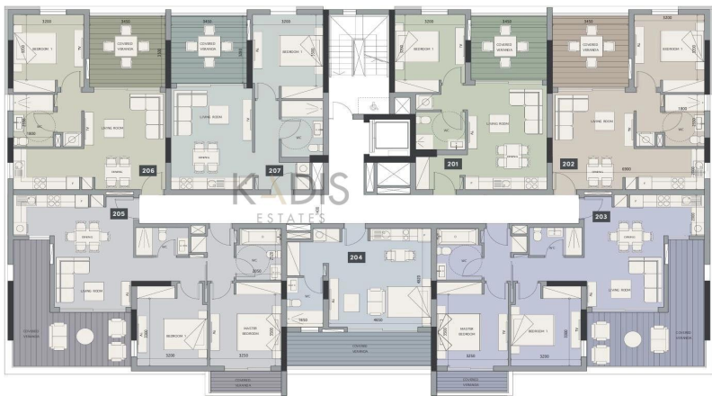
floor plans C, D, E, F