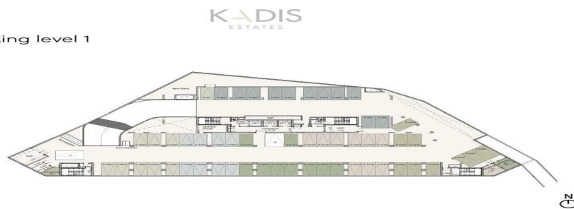
parking level 1