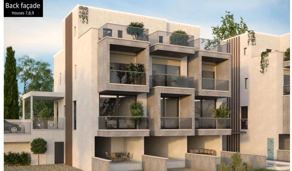
Back façade Houses 7,8,9