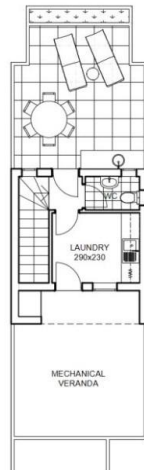
TYPE B 1 TWO BEDROOM HOUSE parking on the site INTERNAL COVERED AREA 17.60M 2 EXT. COVERED AREA 4.84M 2 EXT. UNCOVERED AREA 36.54M 2