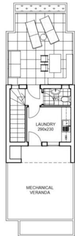
TYPE A 1 TWO BEDROOM HOUSE parking in front INTERNAL COVERED AREA 17.60M 2 EXT. COVERED AREA 4.84M 2 EXT. UNCOVERED AREA 36.54M 2