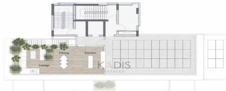
Penthouse Roof Top Garden