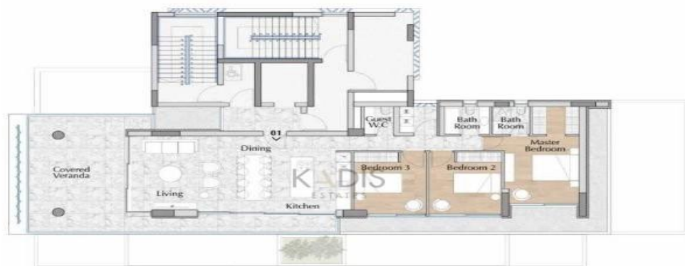
5 th TO 8 th