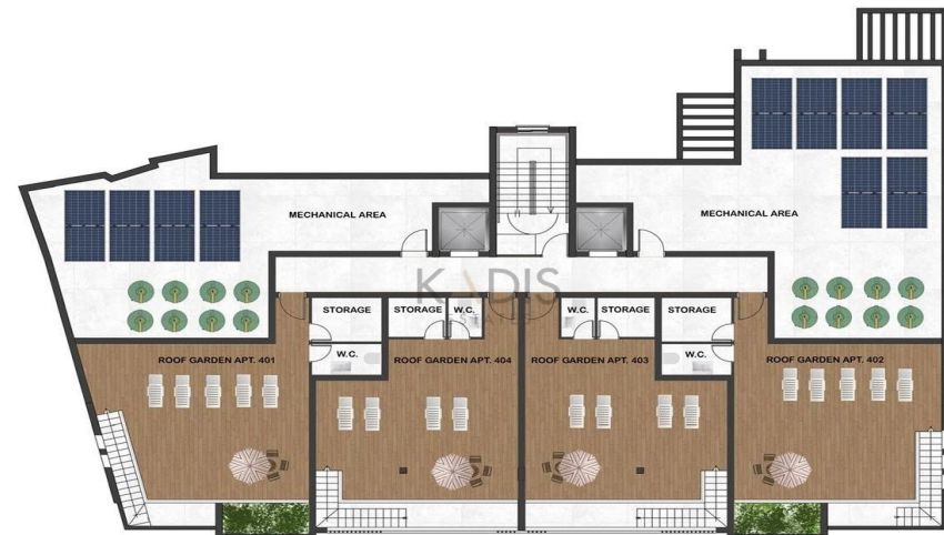
Rooftop terrace layout