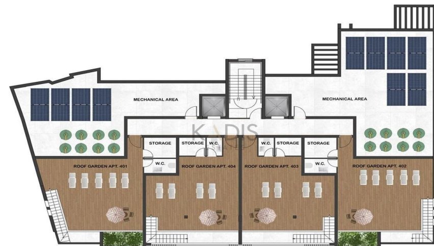
Rooftop terrace layout