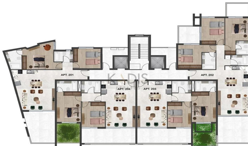
1st, 2nd , 3rd floor layout