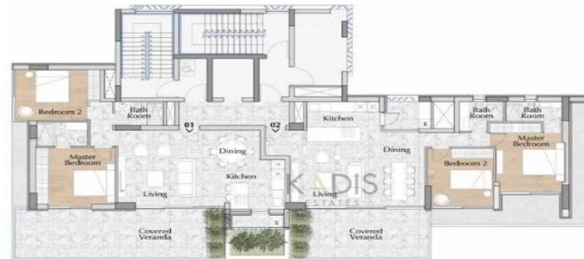
1 st & 3 rd