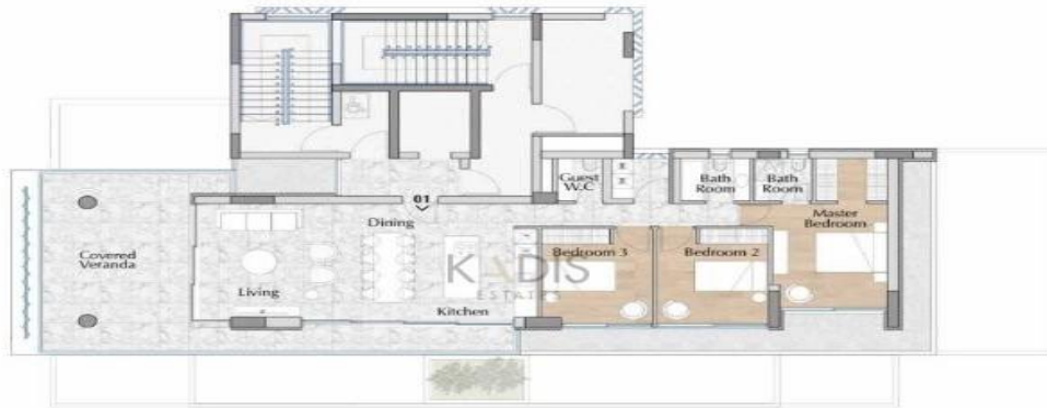
5 th TO 8 th