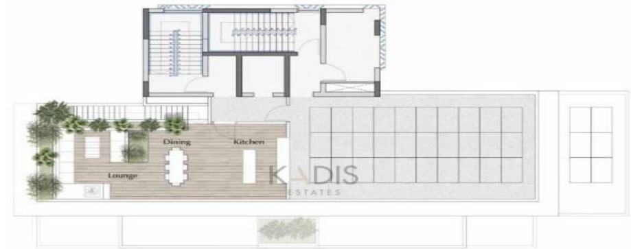
Penthouse Roof Top Garden