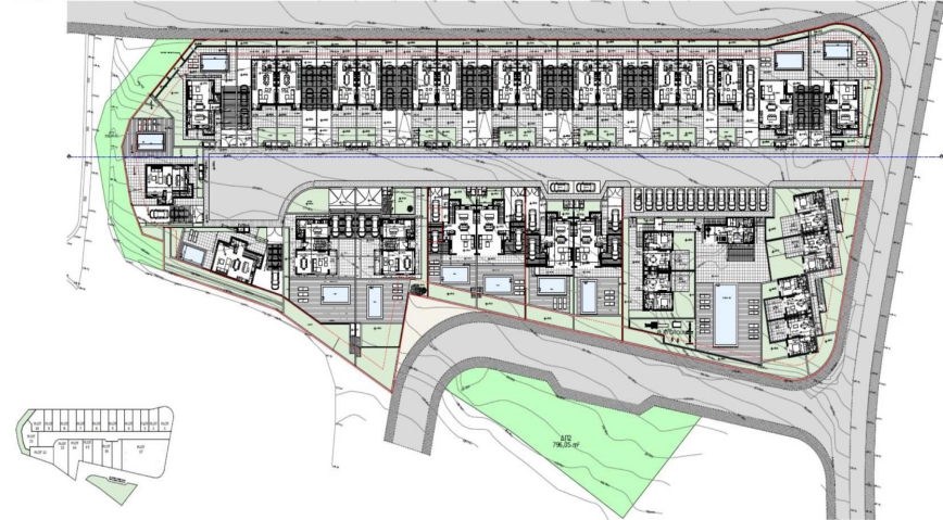
GENERAL MASTER PLAN