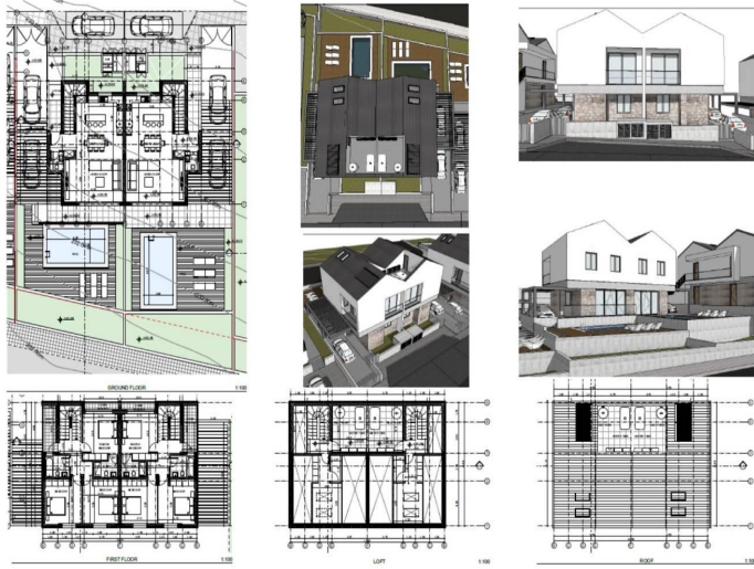
PLOT 16 - RESIDENCE W/3 BEDROOMS | SEMIDETACHED