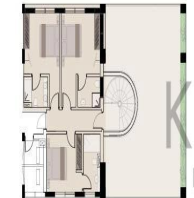
FLAT 303 | 3 BEDROOMS DUPLEX LEVEL 2