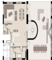
FLAT 303 | 3 BEDROOMS DUPLEX LEVEL 1