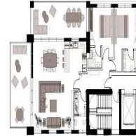
FLAT 204 | 2 BEDROOMS SIMPLEX