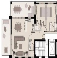
FLAT 304 | 2 BEDROOMS SIMPLEX