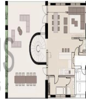
FLAT 302 | 2 BEDROOMS DUPLEX LEVEL 1