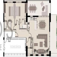
FLAT 102 | 2 BEDROOMS SIMPLEX