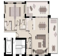
FLAT 401 | 2 BEDROOMS SIMPLEX