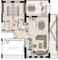
FLAT 103 | 2 BEDROOMS SIMPLEX