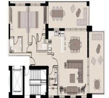
FLAT 201 | 2 BEDROOMS SIMPLEX