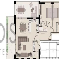
FLAT 202 | 2 BEDROOMS SIMPLEX