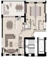
FLAT 104 | 2 BEDROOMS SIMPLEX