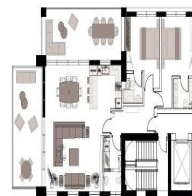
FLAT 204 | 2 BEDROOMS SIMPLEX