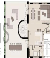
FLAT 302 | 2 BEDROOMS DUPLEX LEVEL 1