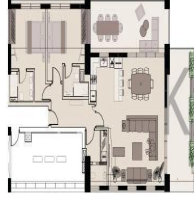
FLAT 103 | 2 BEDROOMS SIMPLEX