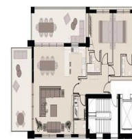
FLAT 402 | 2 BEDROOMS SIMPLEX