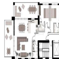
FLAT 204 | 2 BEDROOMS SIMPLEX