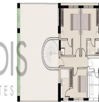
FLAT 302 | 2 BEDROOMS DUPLEX LEVEL 2