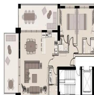
FLAT 304 | 2 BEDROOMS SIMPLEX