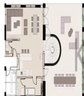
FLAT 303 | 3 BEDROOMS DUPLEX LEVEL 1