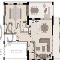
FLAT 102 | 2 BEDROOMS SIMPLEX