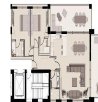
FLAT 401 | 2 BEDROOMS SIMPLEX