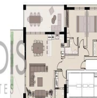
FLAT 202 | 2 BEDROOMS SIMPLEX