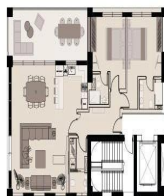
FLAT 104 | 2 BEDROOMS SIMPLEX