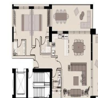
FLAT 201 | 2 BEDROOMS SIMPLEX