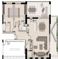
FLAT 103 | 2 BEDROOMS SIMPLEX