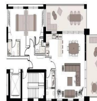
FLAT 301 | 2 BEDROOMS SIMPLEX