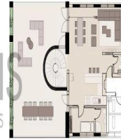
FLAT 302 | 2 BEDROOMS DUPLEX LEVEL 1