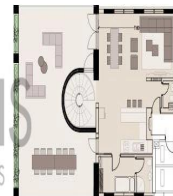
FLAT 302 | 2 BEDROOMS DUPLEX LEVEL 1