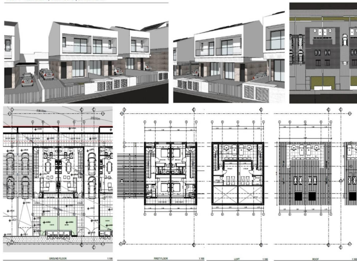
PLOT 4 - RESIDENCE W/ 2 BEDROOMS | SEMIDETACHED